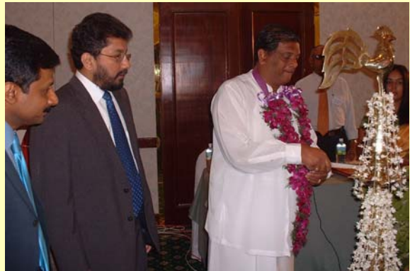
Jeyaraj Fernadopulle, Trade Minister of Sri Lanka, Saman Kelegama of IPS, and Mohan Kumar, Deputy High Commissioner of India at the Inaugural.

The event involved academicians, business chambers, government and inter-governmental organisations and civil society representatives. The project focused on the five key issues of agriculture, non-agricultural market access, development dimensions, services, and trade facilitation.